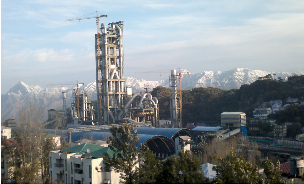
AMBUJA CEMENTS LIMITED. UNIT RAURI (H.P.)